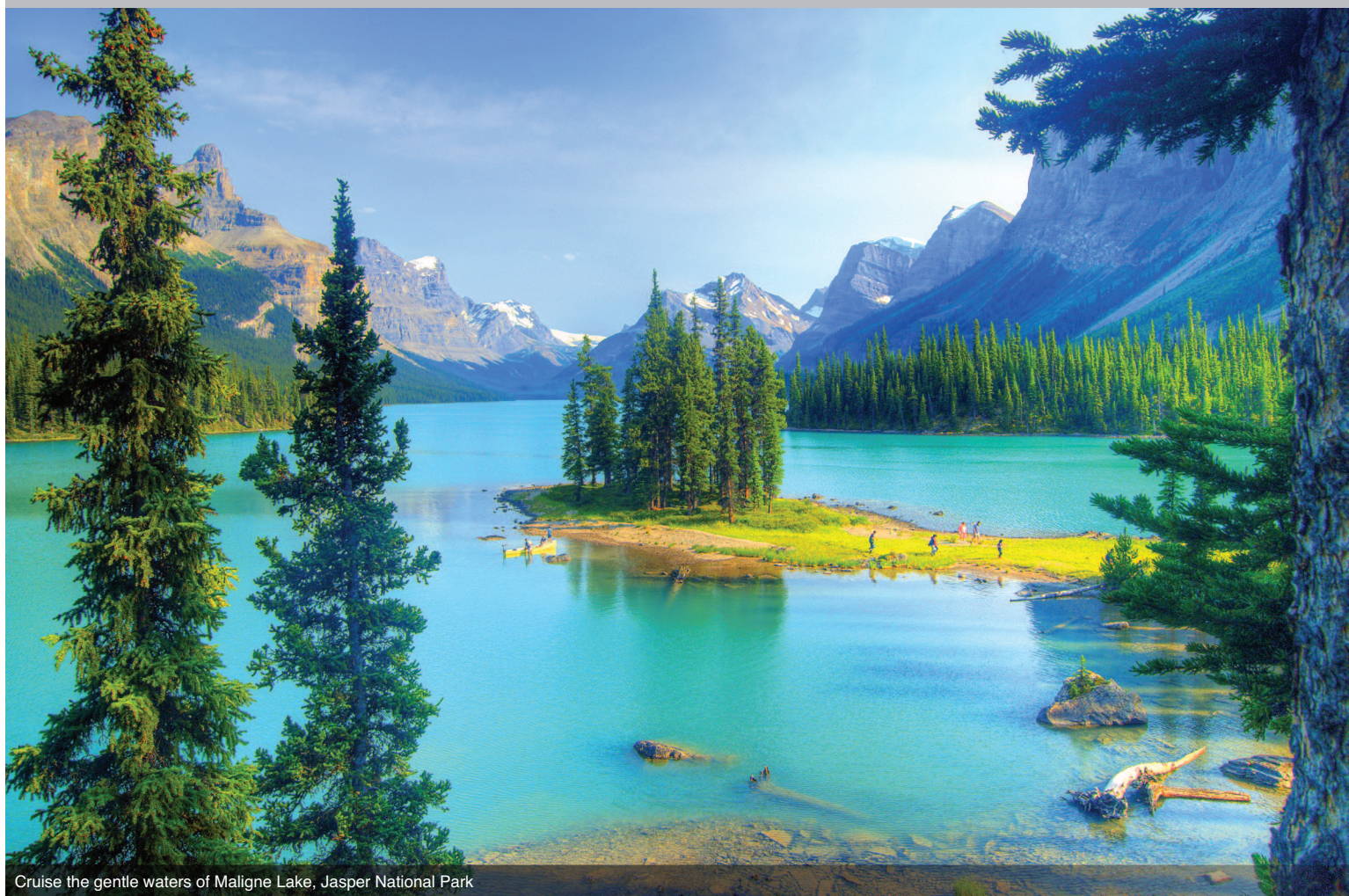
Cruise the gentle waters of Maligne Lake, Jasper National Park