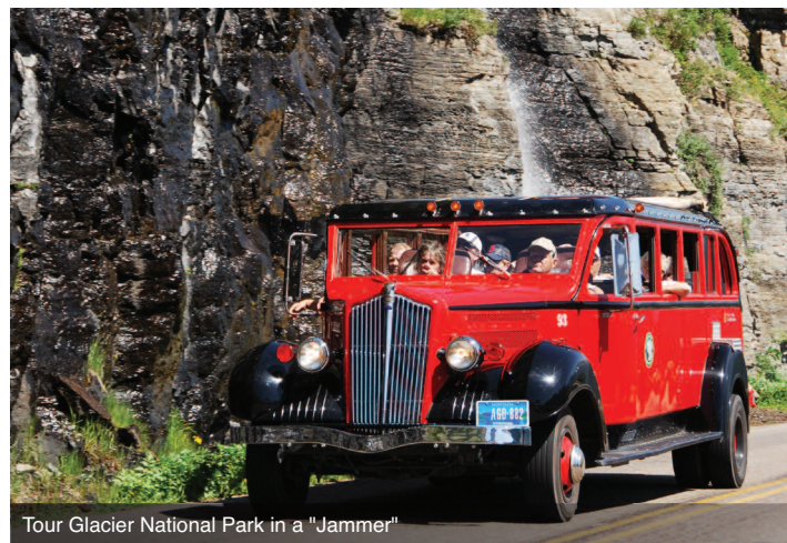
Tour Glacier National Park in a "Jammer"

Today we travel south from Calgary to Waterton Lakes National Park. Embark on a boat cruise of Waterton Lakes, with its deep scenic bays, sheer vertical mountains and beautiful wilderness surroundings. In the afternoon, we visit the Prince of Wales Hotel, one of the most photographed hotels in the world and the setting for our included lunch before arriving at scenic East Glacier and our hotel. (Breakfast and lunch)