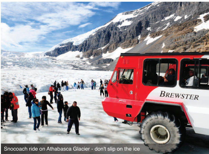
Snocoach ride on Athabasca Glacier - don't slip on the ice