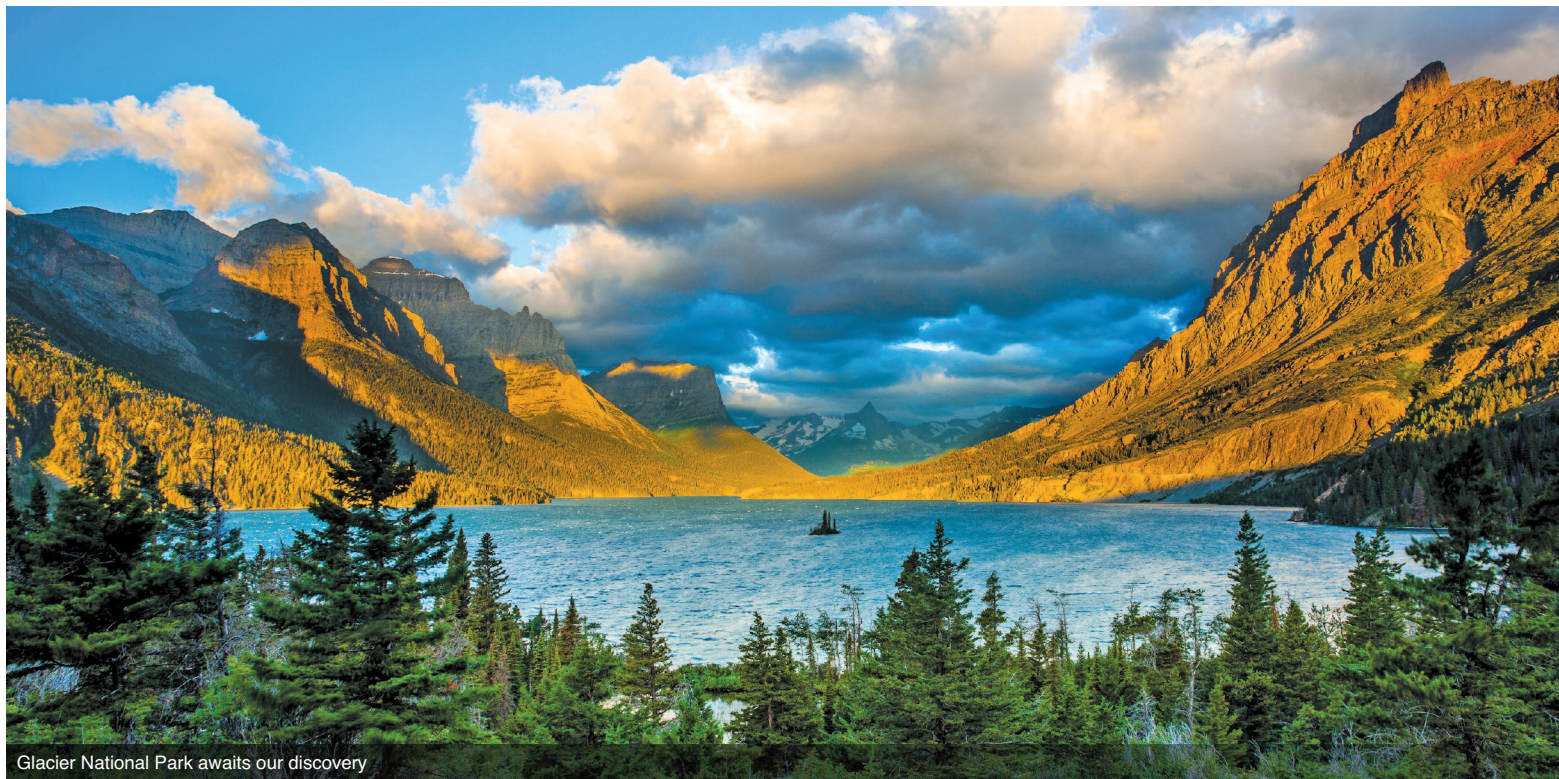
Glacier National Park awaits our discovery