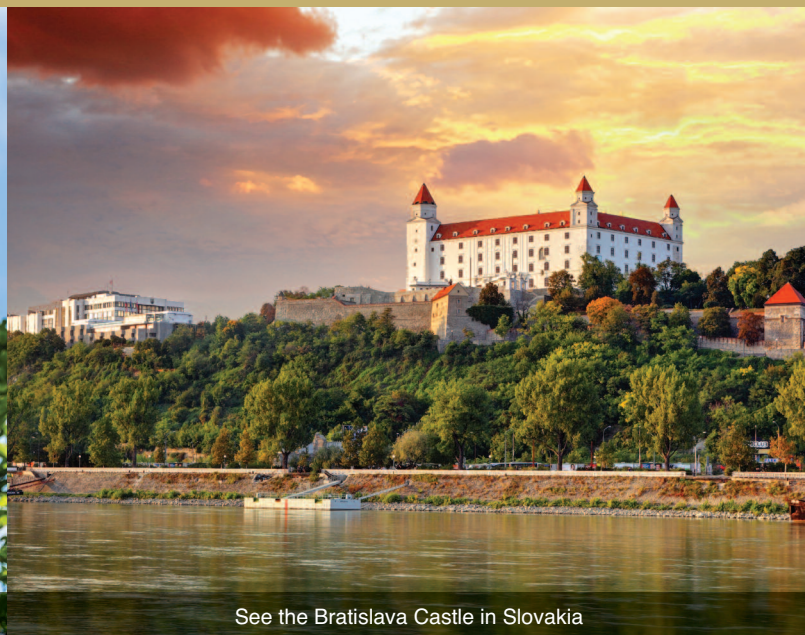
See the Bratislava Castle in Slovakia