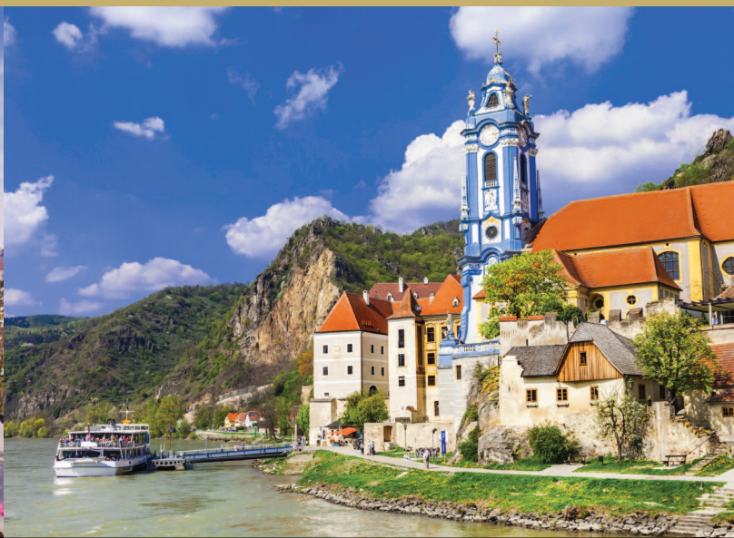
Dürnstein, Austria, the 'Pearl of the Wachau Valley'