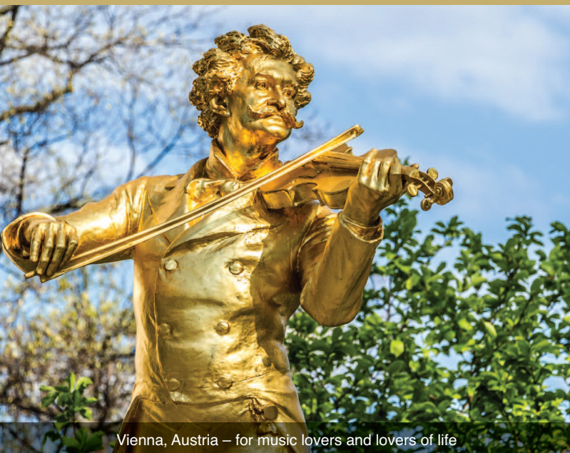
Vienna, Austria – for music lovers and lovers of life