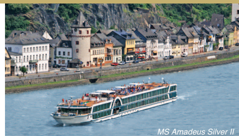
MS Amadeus Silver II