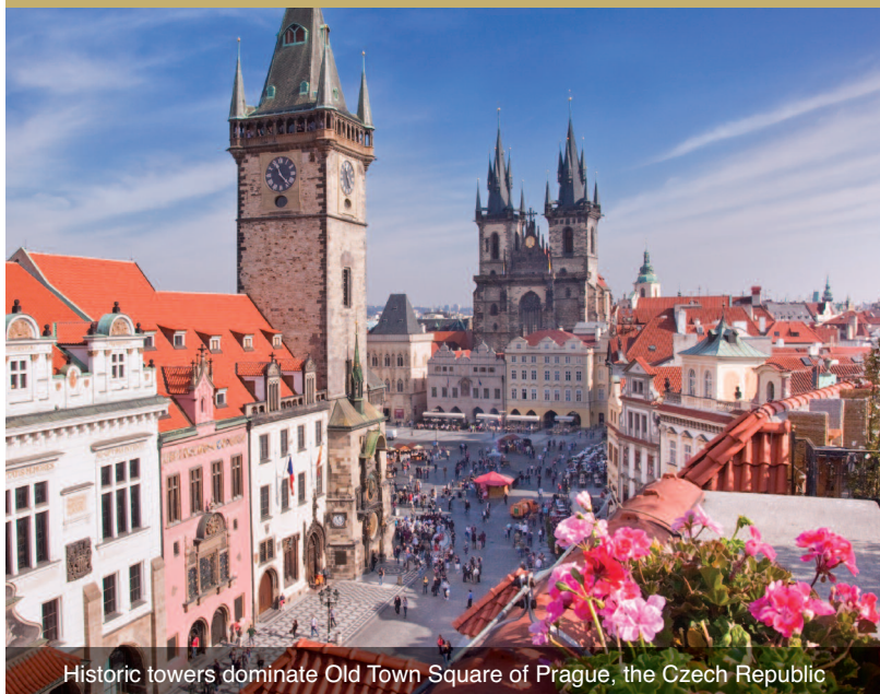
Historic towers dominate Old Town Square of Prague, the Czech Republic