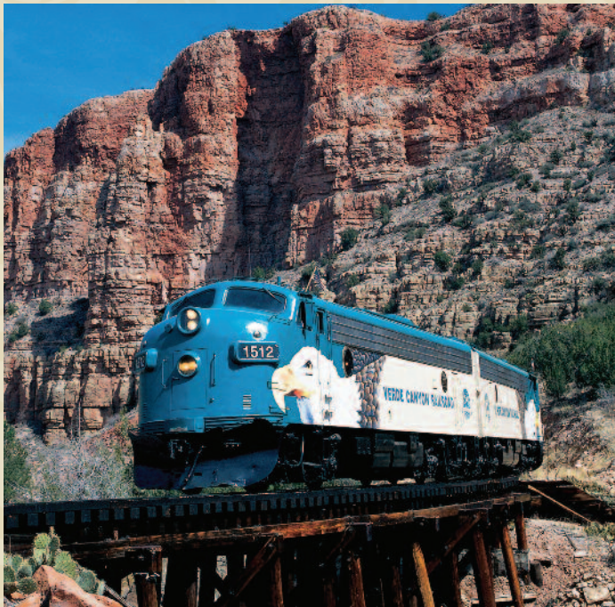
Journey aboard the Verde Canyon Railroad

Our Arizona adventure comes to a close today with a group transfer to Phoenix Sky Harbor International Airport for flights out after 12:00 p.m. Meal: B