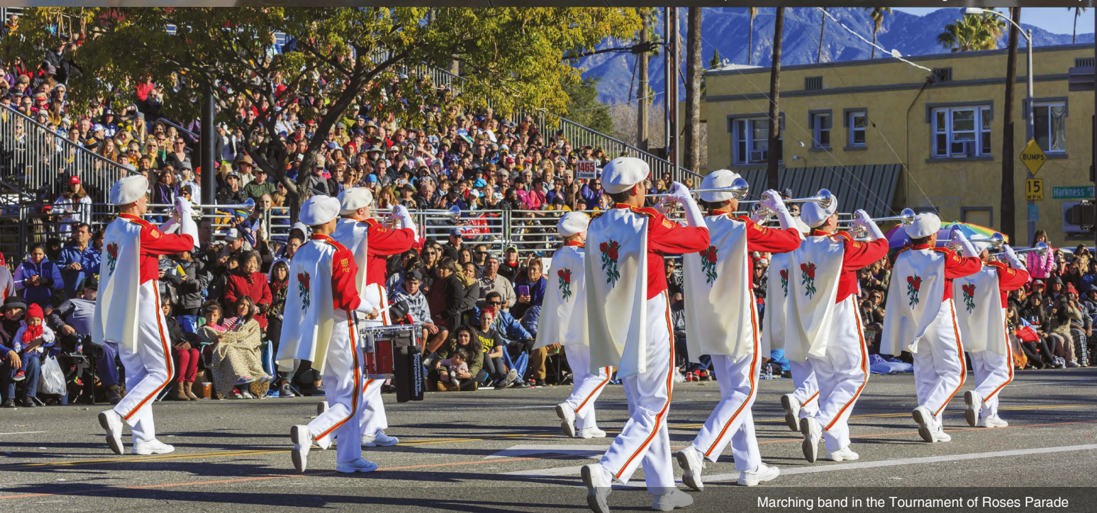
Marching band in the Tournament of Roses Parade

Ronald Reagan Presidential Library which chronicles the storied career of Ronald Reagan which spanned more than five decades. This evening, ring in the New Year with your newfound friends at a private New Year's Eve gala event. Put on your dancing shoes as a live orchestra fills the room with sounds from yesterday and today. Enjoy a spectacular dinner and champagne toast to celebrate the dawning of a New Year. Meals: B, D