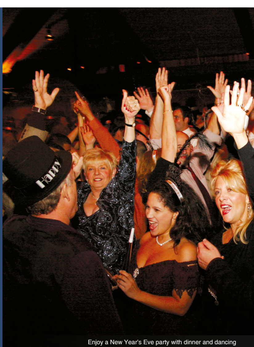
Enjoy a New Year's Eve party with dinner and dancing

Day 1 – Arrive in Southern California: Welcome to the Granddaddy of parades, the 133rd Tournament of Roses Parade, featuring the beautiful pageantry and tradition of magnificent floral floats, high-stepping equestrians and spirited marching bands. For five nights, stay at the Renaissance Long Beach Hotel.