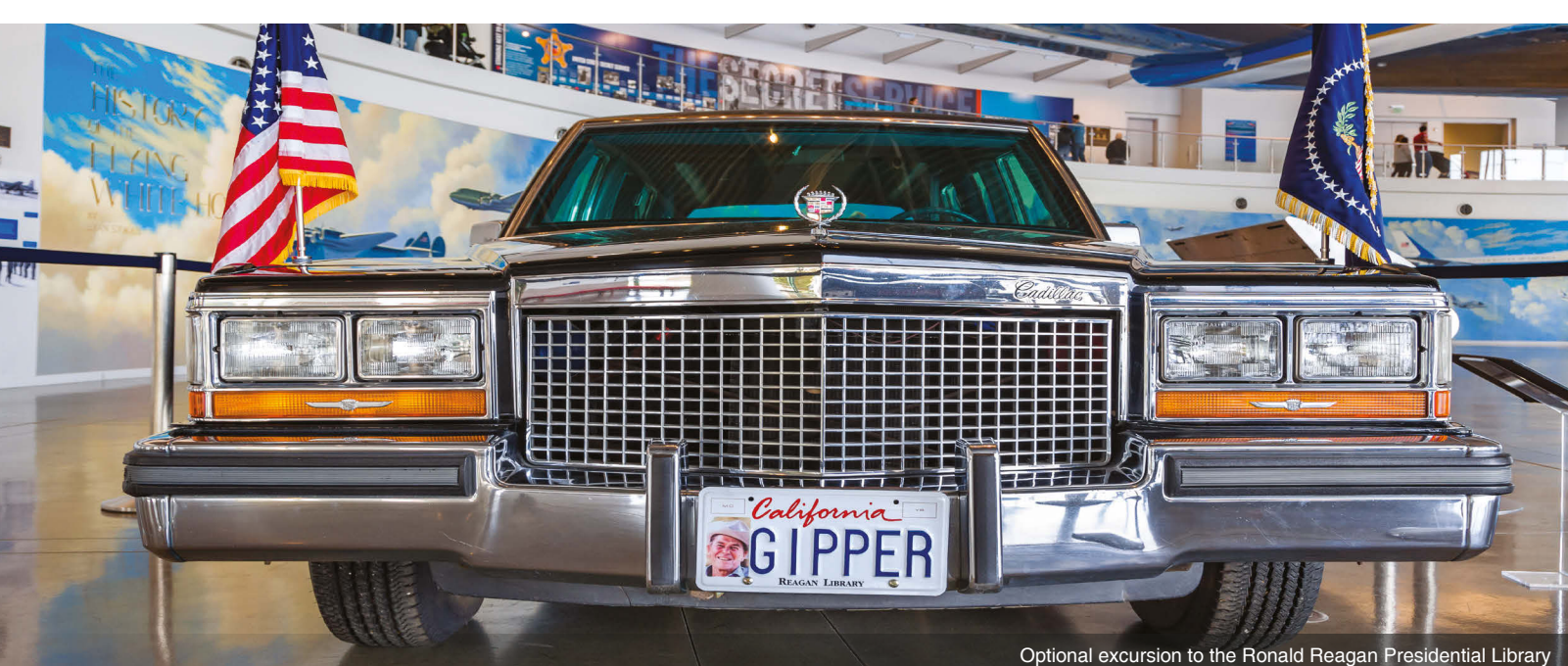
Optional excursion to the Ronald Reagan Presidential Library